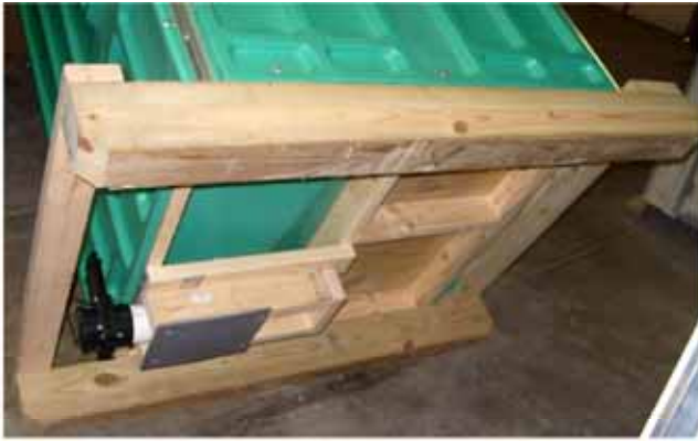
SJHDDV 450 – Under-Section Dump Assembly