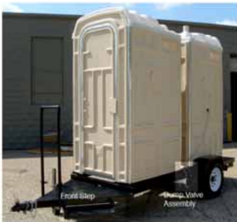
Dual Dump Valve Toilet Trailer with Internal Sinks