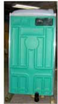
Rear View of Dump Valve Model SJ 450