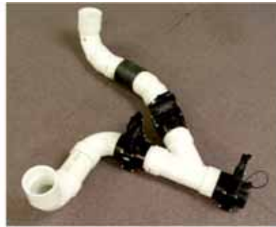
Dual Toilet Dump Valve Assembly