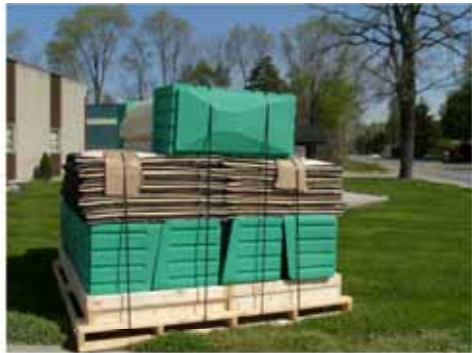
10 Complete Model FPT 300 Units

Flip Top Holding Tank Allows for Complete Cleaning and Inspection For Trash