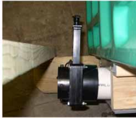
Rear View Of Dump Valve With Cap