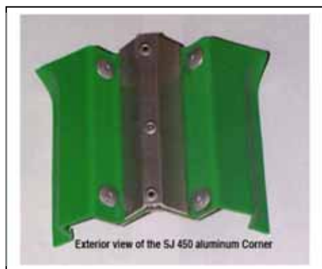
Exterior Aluminum Corner

The unique characteristics of the Model SJHG 450 portable toilet are: Dimensions 44" (112cm) x 44" (112cm) x 89" (239cm) Holding Tank Capacity 68 Gallon (257 liters)