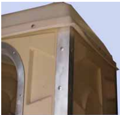
Aluminum Covered Edges

Economical, Attractive Designed for Low Maintenance Light-Enhancing Roof 41" x 41" x 80" 186 lbs.