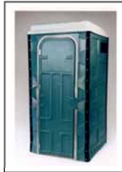
Model FPT 300