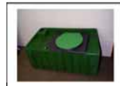
Flip Top Holding Tank

Assembles and disassembles in less than 3 minutes